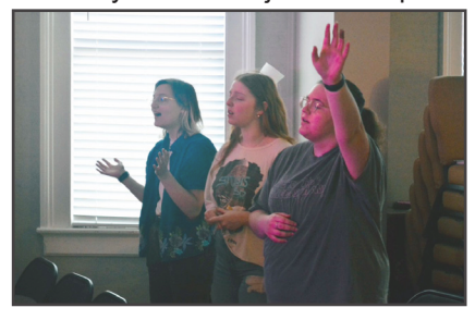
Wednesday - Small Groups - 7:30 p.m.